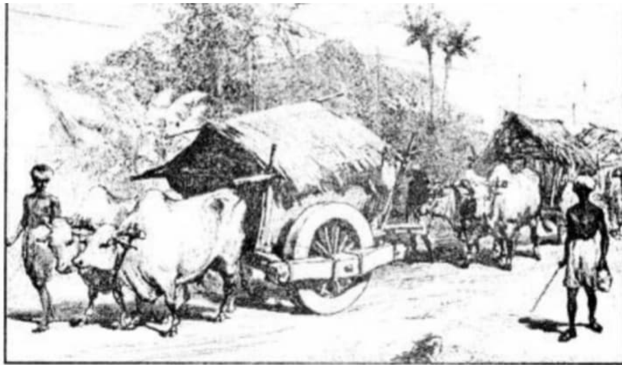
Departure to nearby towns and cities in search of food.